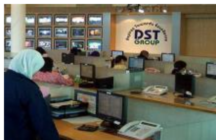
DST Group offers many services from its headquarters (WIPO Pub WIPO-ASEAN/IP/BKK/06/DRAFT)

Within the telephony sector, for instance, the DST Group commercializes personal phone and cellphone services branded as Easi and Prima. Both brands are commercialized under the management of DST Communication Sdn Bhd, a DST Group company, and have been registered as trademarks in Brunei. Not only are Easi (a pre-paid service) and Prima (a post-paid service) enhancing the DST Group's brand image; the services also form part of the conglomerate's pricing strategy, allowing customers to choose products according to their budget.